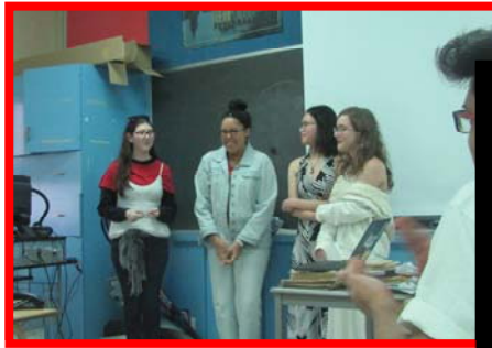
Gr 10 Christmas Party