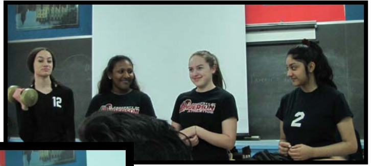
Grade 9—11 Crepe Day