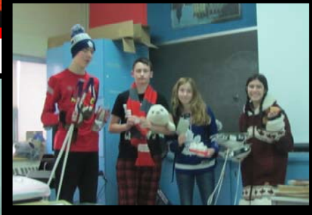
Gr 10 Fashion Show